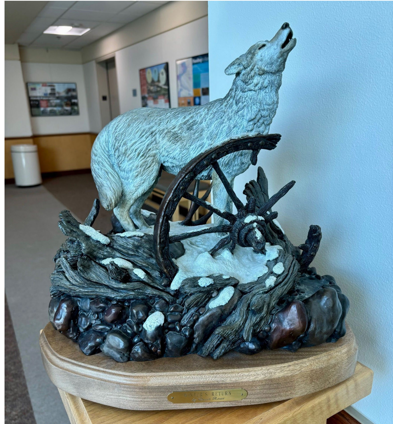
Winters Return by Devin Rowe, 2 nd Floor Lobby