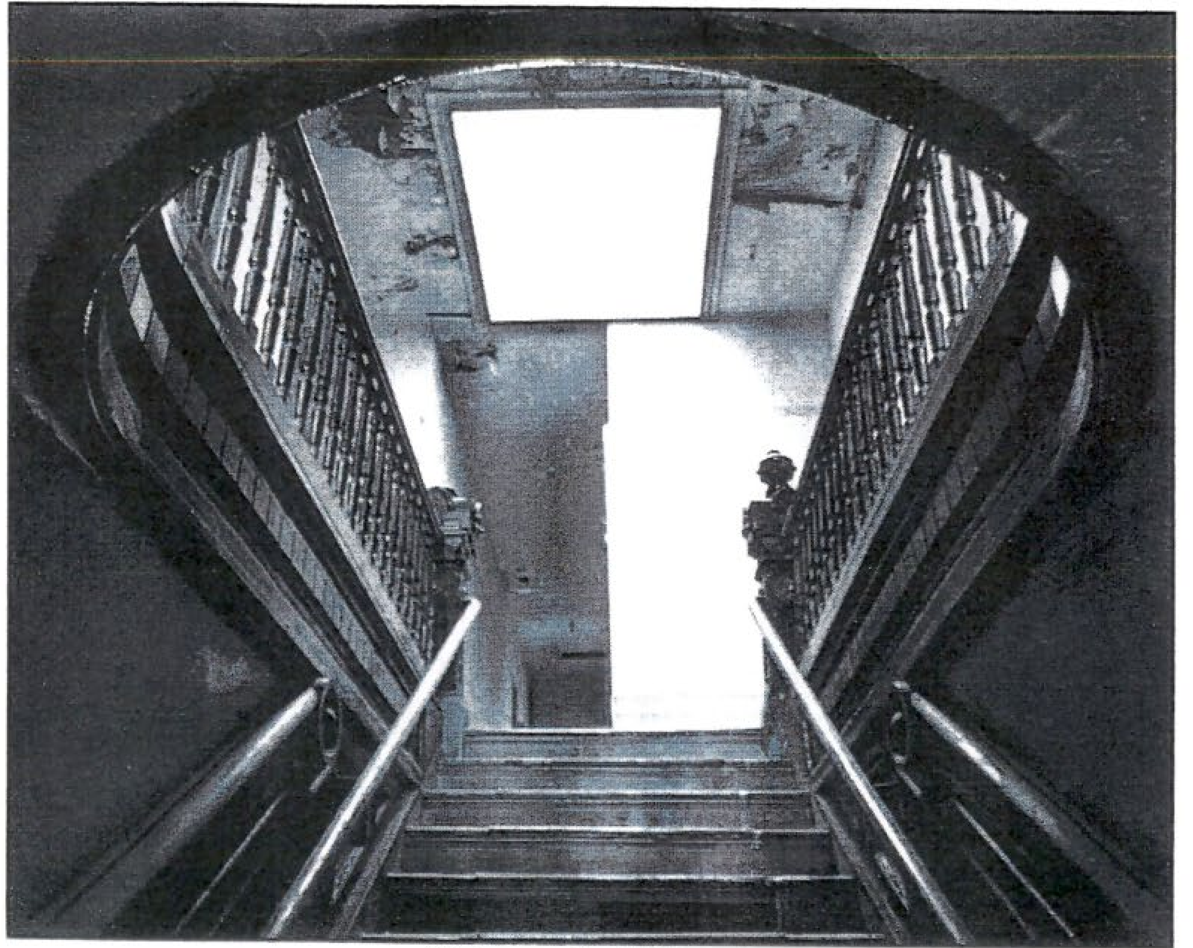
Rich Bergeman – Flynn Block Staircase © Calapooia Room